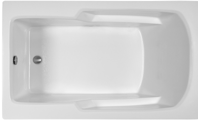
Features integral armrests.